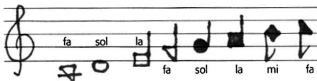
C major scale, written to show how the shapes appear in whole, half, quarter, and eighth notes.

Before singing the words to a Sacred Harp tune, we “sing the notes” by singing the syllables of the shapes.